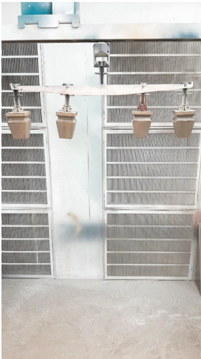
Furniture Bun Feet